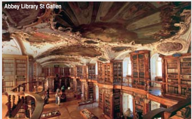
Abbey Library St Gallen

But wait, there is more. You also receive free admission to more than 490 museums nationwide e.g. Chillon